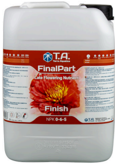
Final Part 10lt